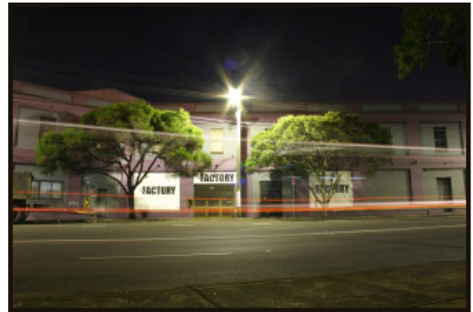
Factory Theatre Night