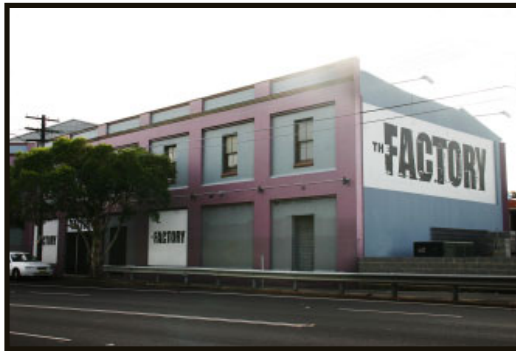
Factory Theatre Day

Sydney Underground Film Festival & Factory Theatre Logos available in standard (as shown) or reverse.