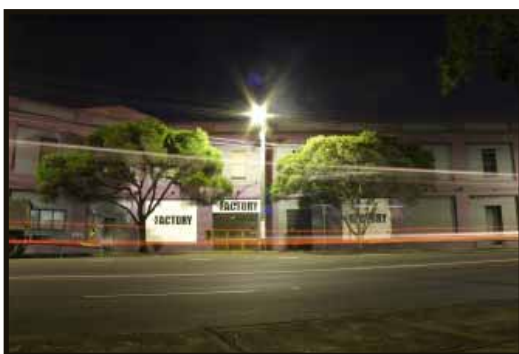
Factory Theatre Night