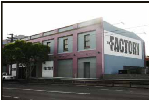
Factory Theatre Day

Sydney Underground Film Festival & Factory Theatre Logos available in standard (as shown) or reverse.